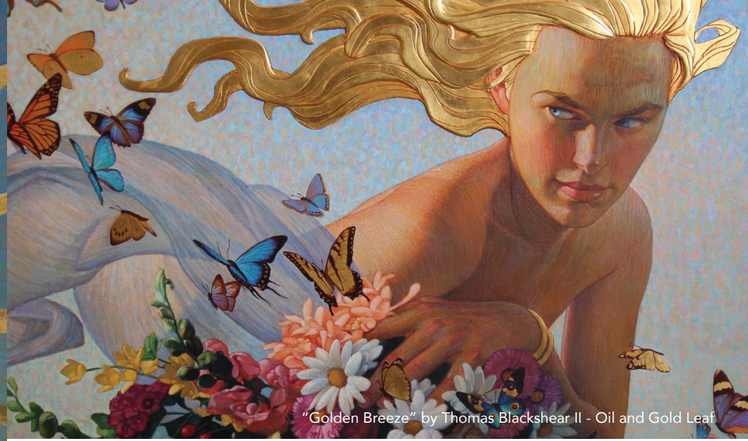
"Golden Breeze" by Thomas Blackshear II - Oil and Gold Leaf