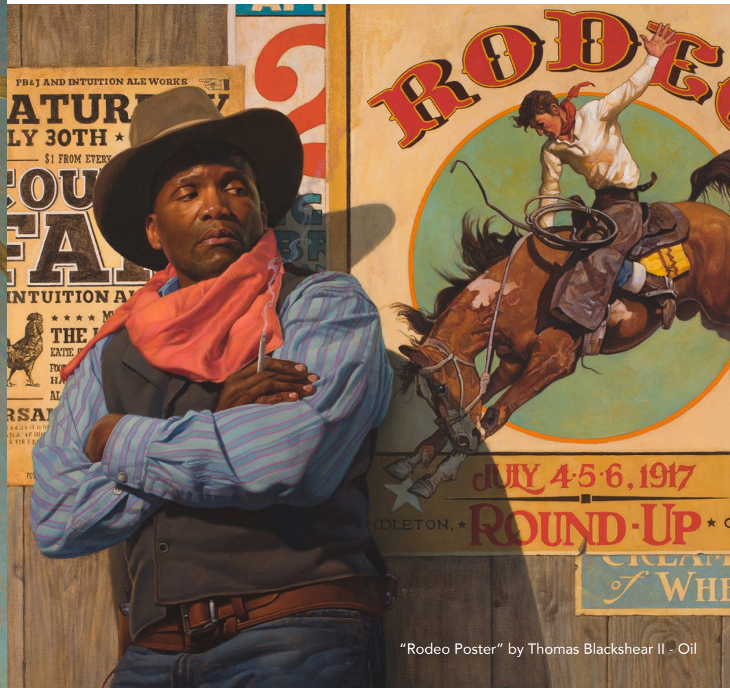
"Rodeo Poster" by Thomas Blackshear II - Oil