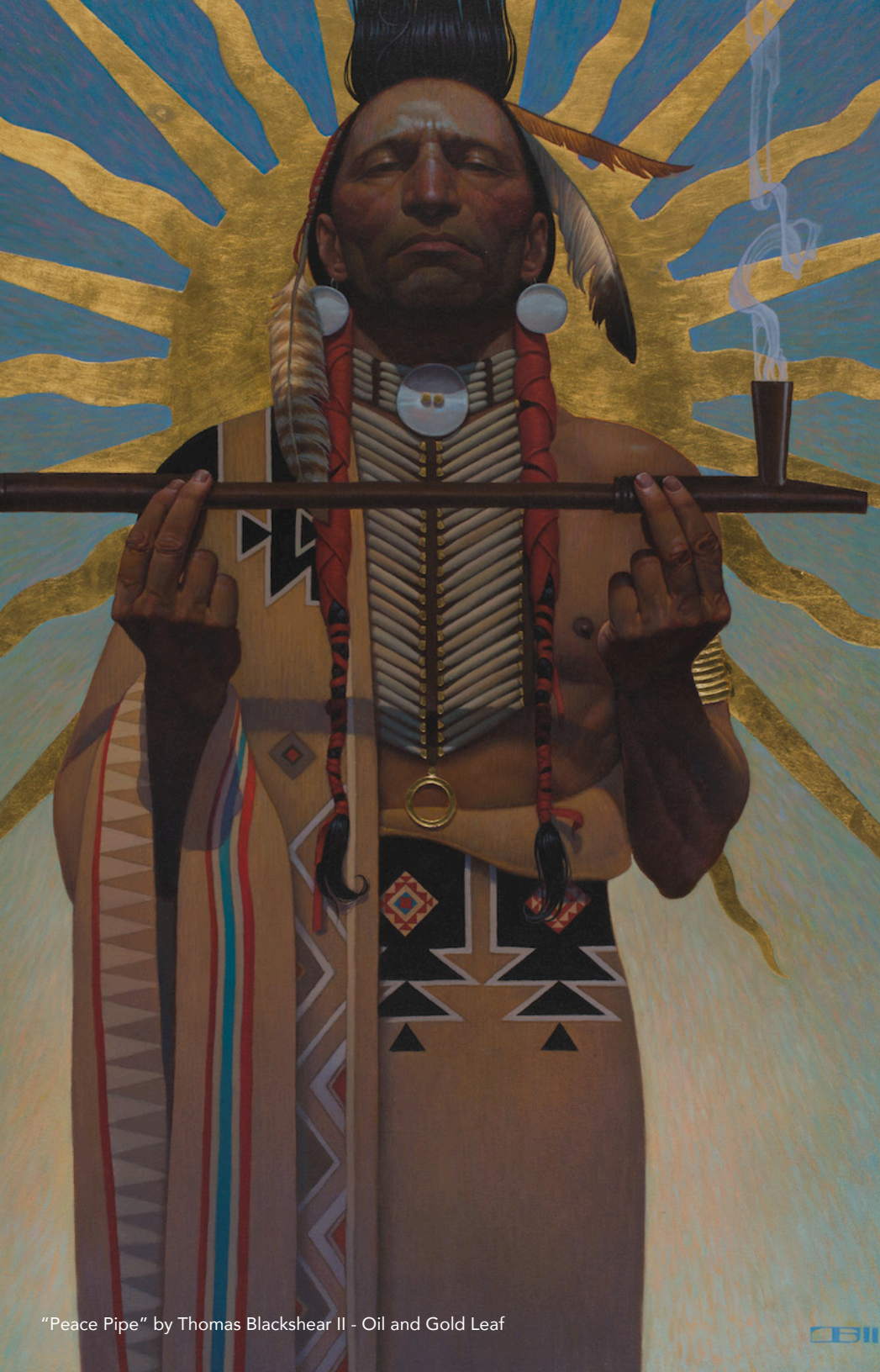
"Peace Pipe" by Thomas Blackshear II - Oil and Gold Leaf